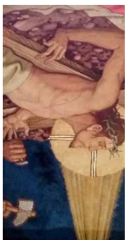
Jesus Is Nailed to the Cross