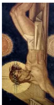
Jesus Dies upon the Cross