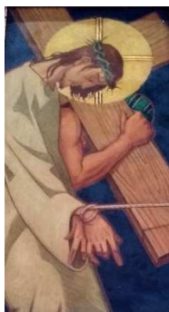
Simon Helps Jesus Carry the Cross