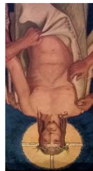
Jesus Is Stripped of His Garments