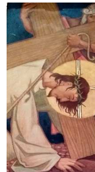
Jesus Falls the Second Time