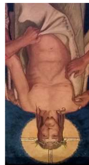
Jesus Is Stripped of His Garments