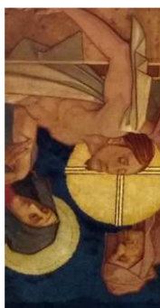
Jesus Is Placed in the Tomb

I love You Jesus, I am so sorry for hurting you.