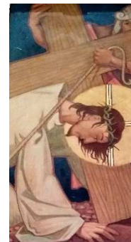
Jesus Falls the Second Time