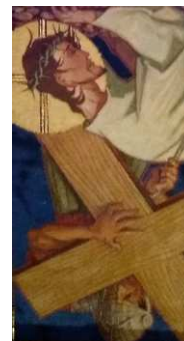
Jesus Falls the Third Time