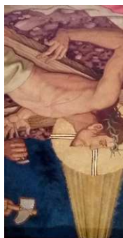
Jesus Is Nailed to the Cross