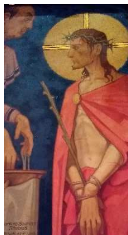
Pilate Condemns Jesus to Die