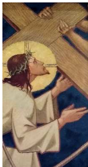
Jesus Accepts His Cross