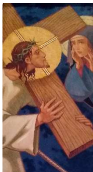
Jesus Meets His Afflicted Mother