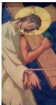
Simon Helps Jesus Carry the Cross