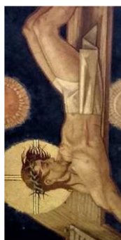
Jesus Dies upon the Cross