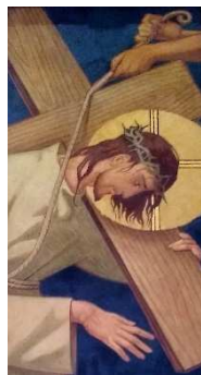
Jesus Falls the First Time