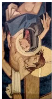
Jesus Is Taken Down from the Cross