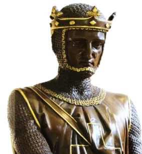
Knight of Christ